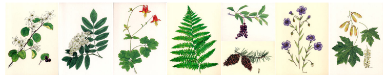
Note cards by Peggy Edwards—sales benefit our chapter.

CNPS activities in Monterey are at montereybay.cnps.org .